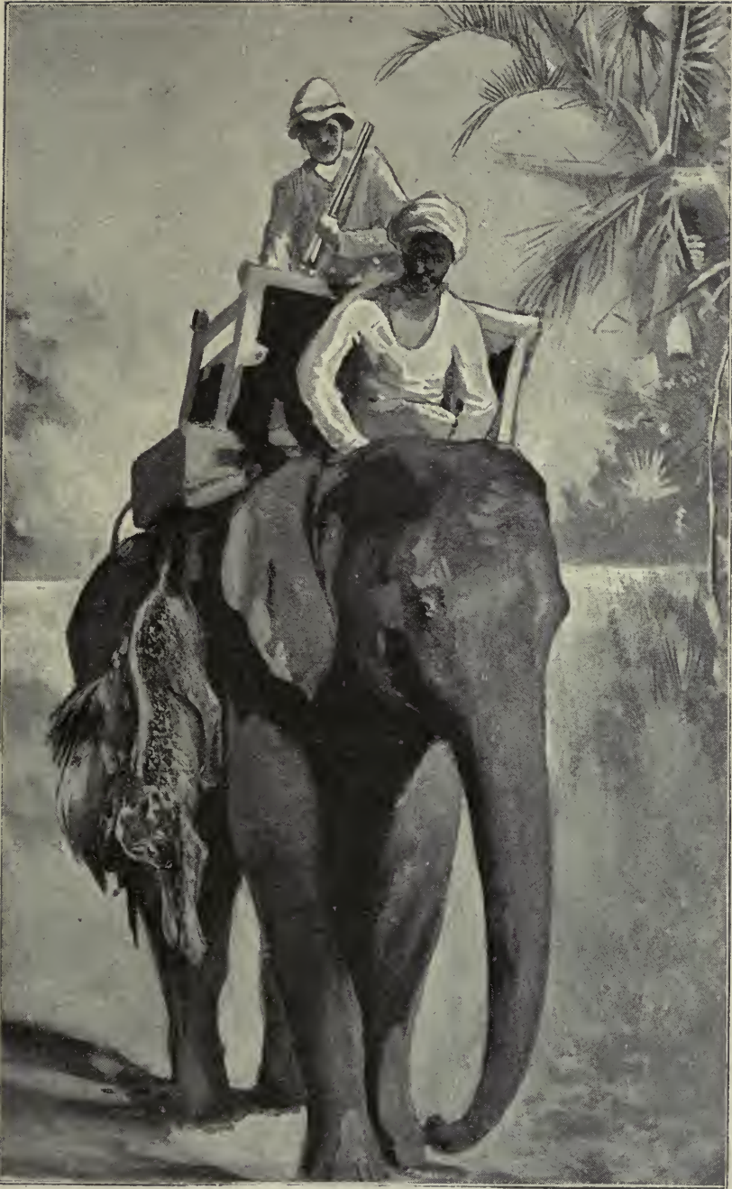
MARCHING INTO CAMP